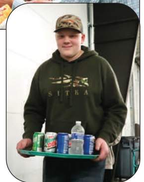
The Lafayette community "hammed it up" at the Fields of Grace Youth Ham Bingo at the fire hall Saturday, March 28. The hall was filled with young and old alike, trying to win half hams, ham slices, and even whole hams. The youth group served a BBQ or hot dog meal beforehand and brought treats around during the games.