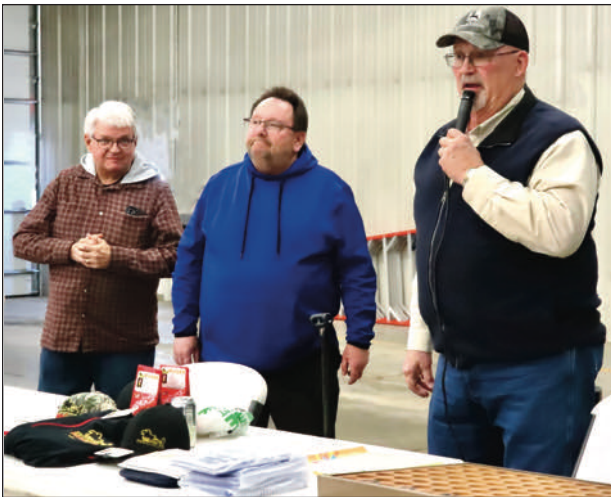
As always, it was a fun evening. Good job, youth and parents!