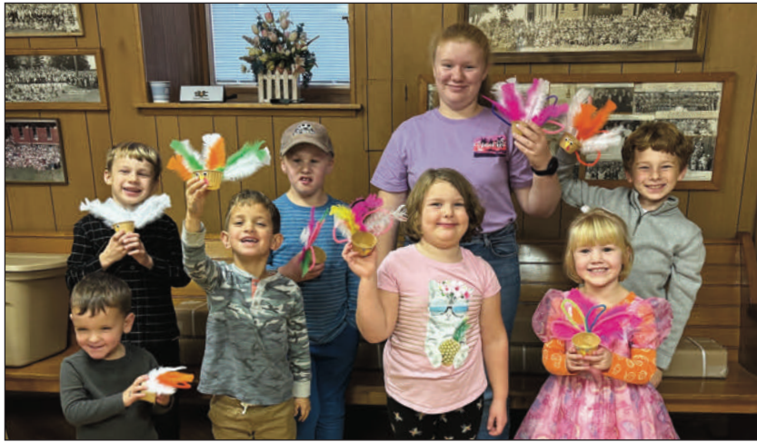
The Sunday School kids talked about gratitude, made gratitude turkeys and a turkey cup craft Sunday, November 24 at Bernadotte, above, and the kids at First Lutheran, Sunday, November 10, below.