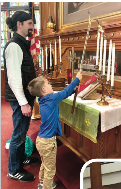
Daddy's little helper