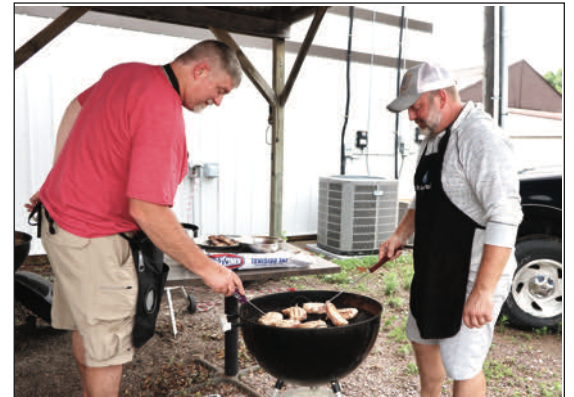
It was only drizzling for the FOG Youth ice cream social Friday, June 14. Along with their parents, the kids had a successful social, serving up pork chops & more.