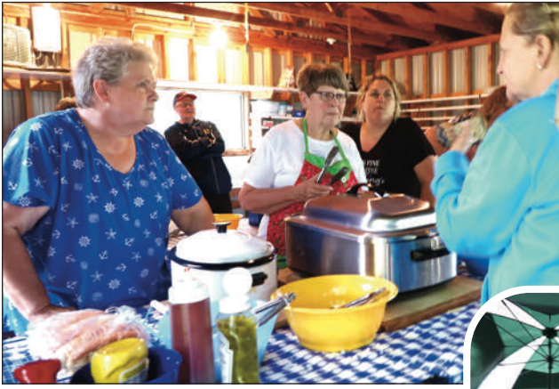
Wet night at Bernadotte June 5