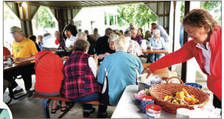
The wind was blowing—but there was no rain—when Bernadotte’s ice cream social got underway. That didn’t last long as the rain started and everything had to be crammed in under cover. Some helpers used umbrellas to move guests to seating in the garage. The band played on—inside!