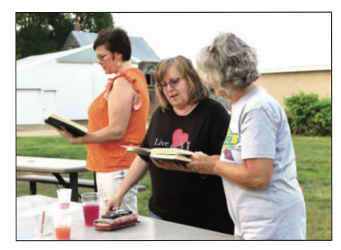
The first of three Beverages and Hymns was held June 5. Future events will be July 24 and August 14.