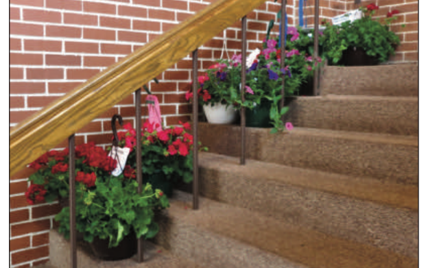
members made some flower deliveries ahead of time, then arranged the flowers by purchaser in the church entryway.