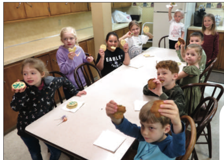
They couldn't do all the things planned when they had to move indoors, but the kids were busy and had fun!