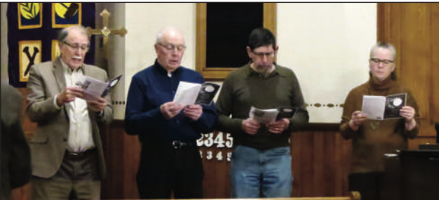
The confirmation students served soup suppers and church members took part in special dialogues during the services.