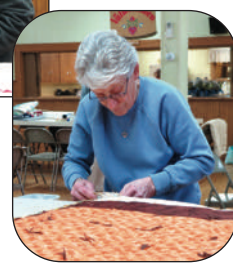
The Bernadotte ladies—with reinforcements from Lafayette—completed lots of quilts when they worked at the church Monday and Tuesday, February 13 and 14. (Half are pictured below.)