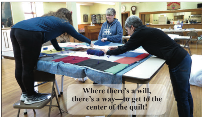
Where there's a will, there's a way—to get to the center of the quilt!