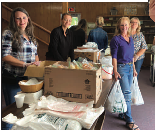
First Lutheran members worked together to put on the annual fall festival Sunday, October 2. It included a drive through dinner, farmers' market, bake sale, and quilt raffle.