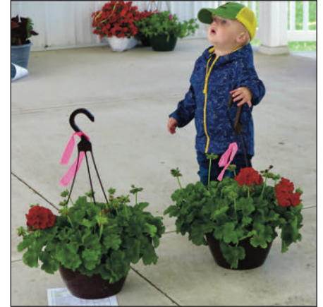
Blooming in Bernadotte