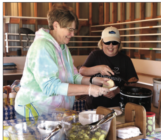
Minnesota's unseasonably cold spring pushed the Blooming in Bernadotte flower pickup back by two weeks—and the weather was good on May 14. The event also included a bag raffle, a wine pull and a barbecue lunch served up by the committee.