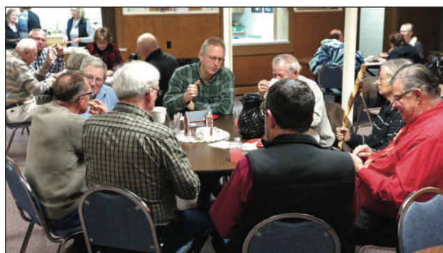
Everyone enjoyed refreshments in the fellowship hall afterwards.