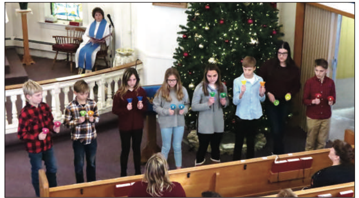
The Sunday School kids, above, and the confirmation students, top right, sang and played the bells during the Sunday service, December 12. Pastor