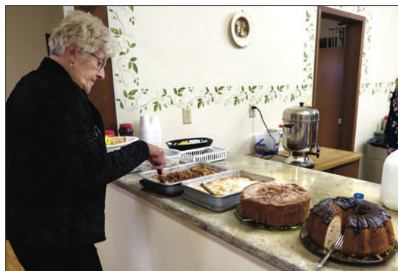
Just look at all those goodies that Swan Lake served up!