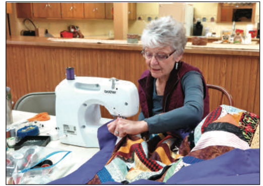
Eight ladies quilted on Wednesday, February 10 (above) and ten on Thursday, February 11 (bottom).