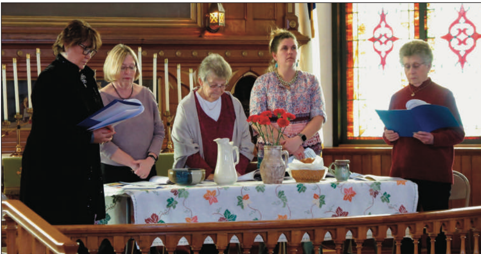
It was one of those snowy days when Bernadotte hosted the World Day of Prayer program Friday, March 1.