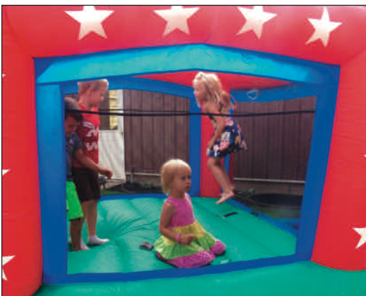
The kids had fun in the bounce house, on horse-drawn wagon rides, and with the bean bag game.