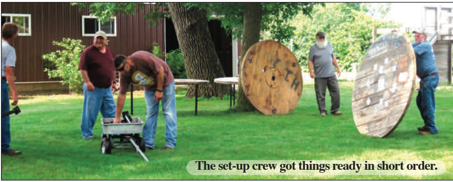
The set-up crew got things ready in short order.