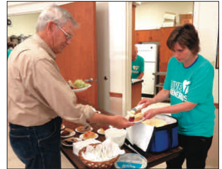
First Lutheran's WELCA served tacos in a bag for the Lafayette ice cream social before the Friday, June 8 band concert.