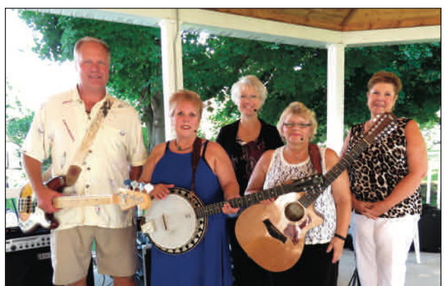
Outdoor Services at Bernadotte Church Park