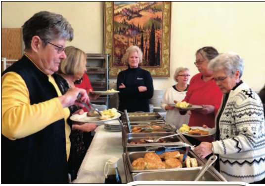
About two dozen ladies took part in Bernadotte's brunch at Hahn's in Winthrop January 9. It was a nice get-together on a winter morning.