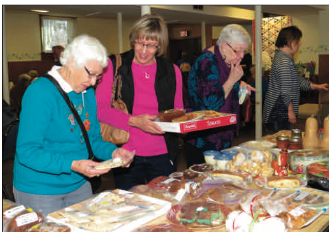
Those baked goods looked very good...and flew off the tables!

grand champion Brown Swiss cow, and petted baby calves and the Swenson's collies. As she watched the robotic milkers, we all agreed that milking cows has changed a lot over the years!