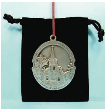
Pewter Christmas Ornaments $10.00 each