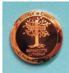
Lapel Pins $4.00 each