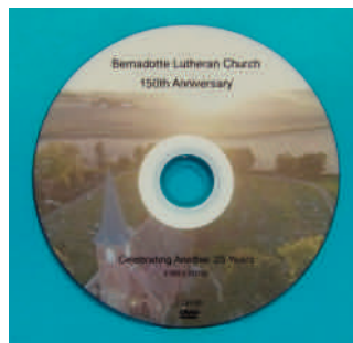
150th Anniversary DVD $15.00 each