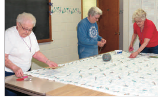
First Lutheran April 4 & 5 and completed a bunch of beautiful and useful quilts.