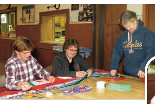
Women from First Lutheran and St. Gregory's joined together to make quilts for missions at

Items will be available at the anniversary and later at the church; make payment to "BLC 150th Anniversary."