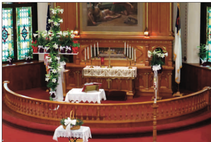
BLC decorated and ready for Easter

Quilting Days will be held at First Lutheran on Monday and Tuesday, April 4 and 5, from 9:00 am to ?? Bring something to share if you wish. Everyone is welcome.